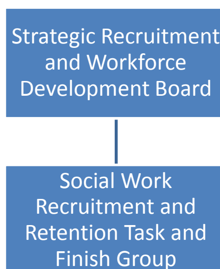
Figure 2: Social Care Recruitment and Retention Governance Structure

The CFA directorates that employ social care staff are taking a joint approach to recruitment in collaboration with LGSS (HR). To enable cross directorate working, the Strategic Recruitment and Workforce Development Board has been created to proactively address the issues of recruitment and retention and the development of relevant skills and experience. The board is chaired by the LGSS Head of People with membership including Service Directors of Older People and Mental Health, Adult Social Care, Children's Social Care and Director of Learning who leads on workforce development. They own and are responsible for the delivery of this strategy.