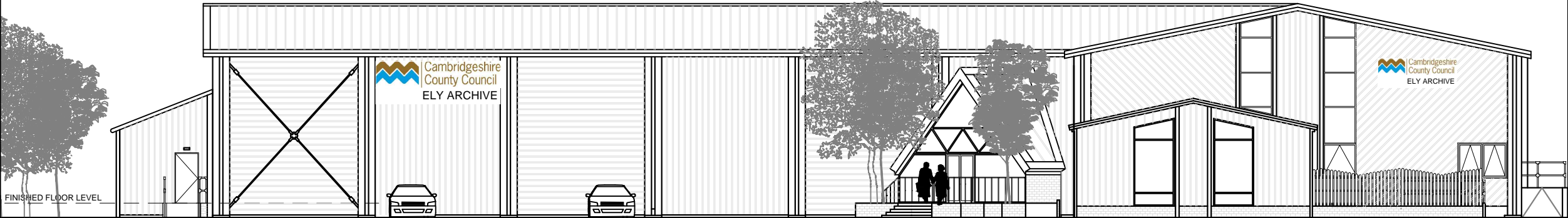
ELEVATION TO NORTH-EAST