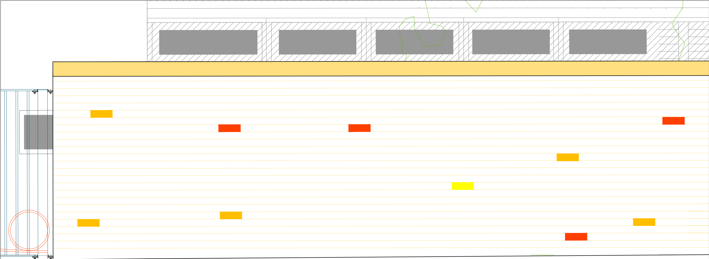
Boundary wall design (1.8m - 2.0m high)