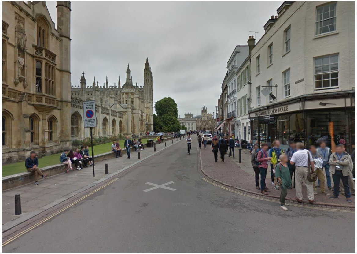
Kings Parade, Cambridge