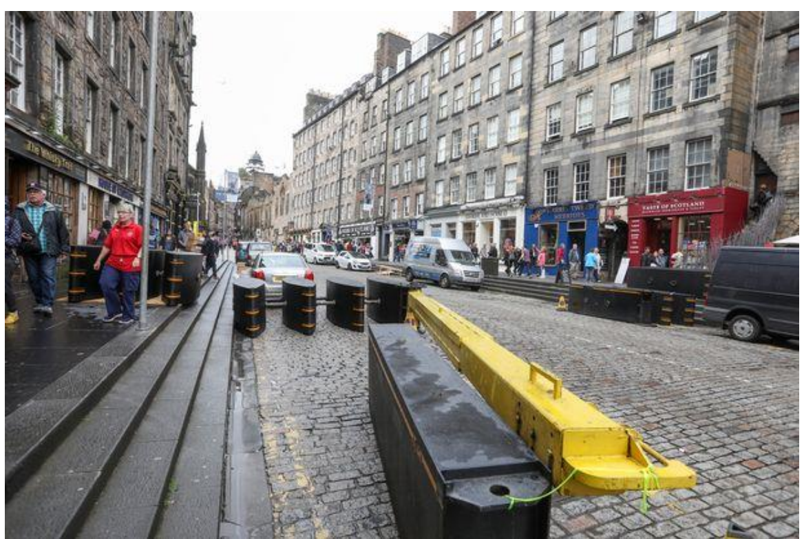
Edinburgh's Royal Mile (for Edinburgh Festival)