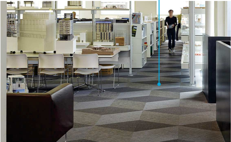
AHMM Studio, London