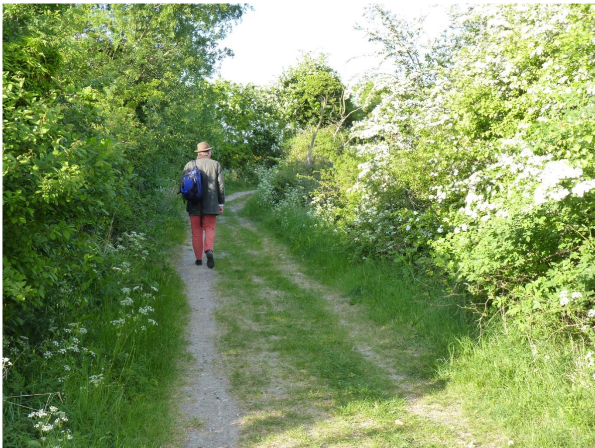
Drove Lane, Wicken