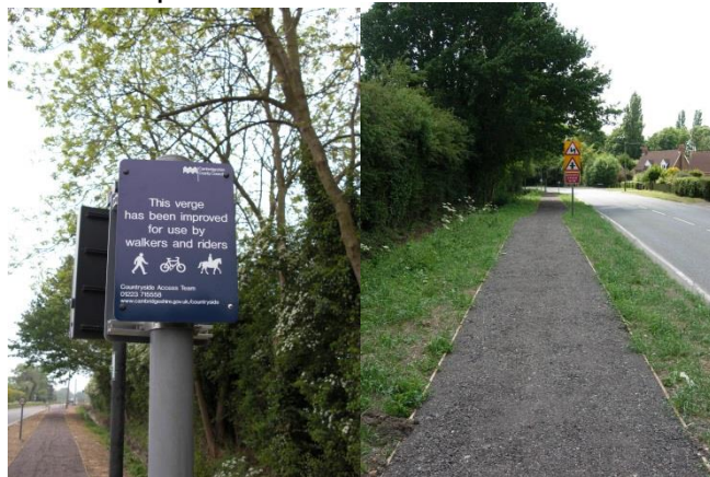
Hilton verge improvements

Through the ROWIP 2006 a number of bridleways have been improved, as discussed in Section 1. We will continue to work with colleagues and developers to ensure equestrian needs are considered during scheme development.