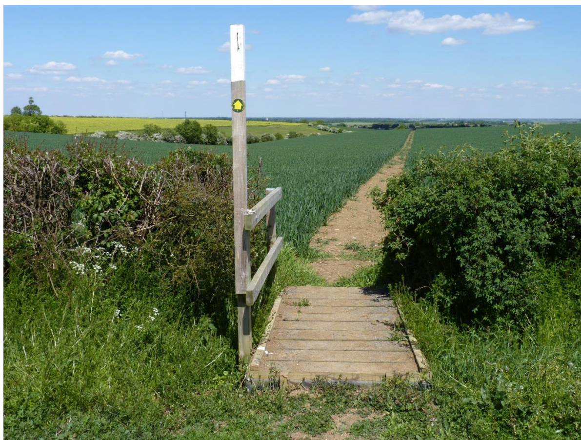
Bridge reinstatement Sawtry (Footpath 27)

Within our limited resources, we endeavour to keep the path network in good condition by reactive maintenance. Where cropping problems are reported on arable land, enforcement action may be taken, starting with talking to farmers. Problems with fly-tipping and dogs are resolved in partnership with District Councils. Misuse of paths by motor vehicles is referred to the police for appropriate action.