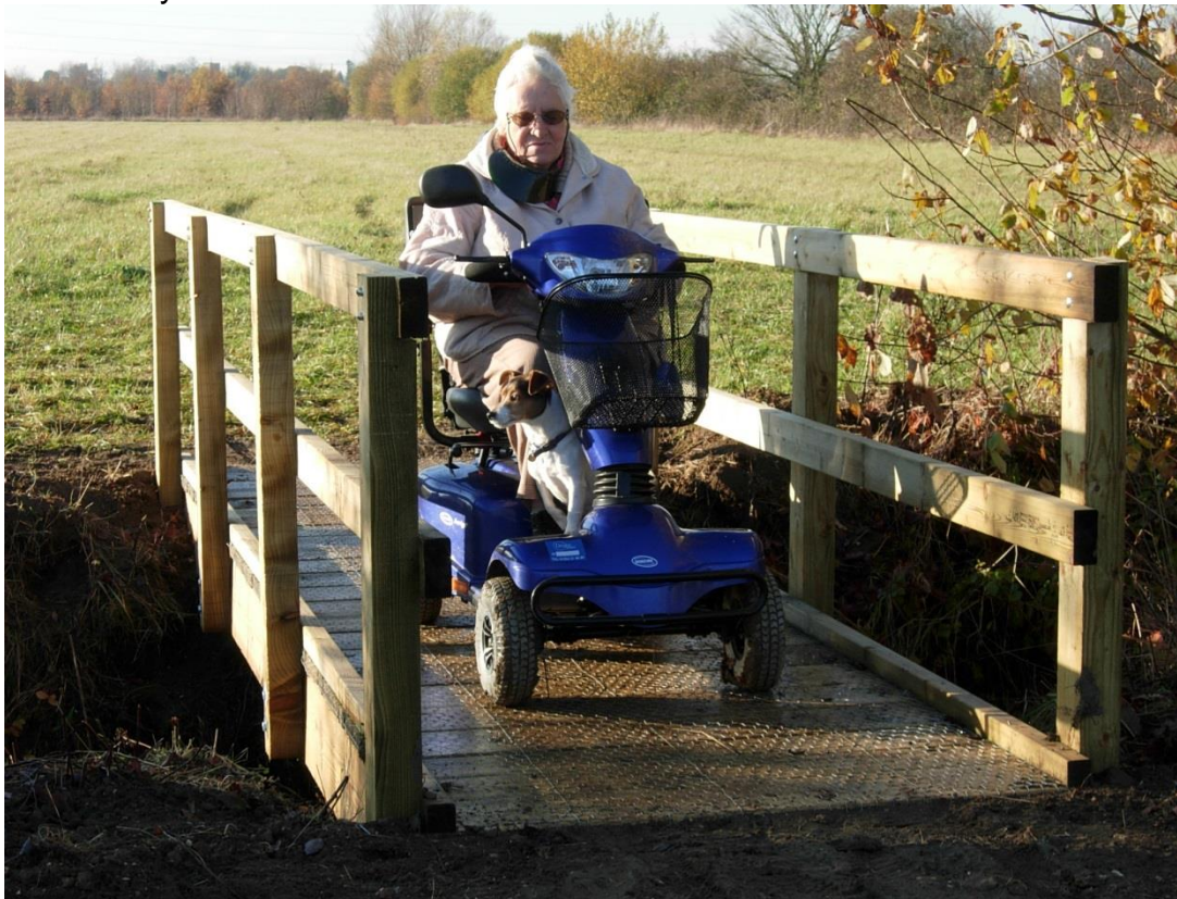
Access for wheelchair users at Histon/Girton woodland

The Equality Act 2010 makes it an offence to prevent people with disabilities from enjoying countryside access. Since the Plan was adopted, gates have replaced stiles in numerous locations to improve access for wheelchair users and people with reduced mobility. In addition, a number of rights of way have been improved or resurfaced, and over 300 distance and finger signs have been put in place. Subject to resources, we will continue with this programme to enhance access to the countryside. In addition we would support communities to undertake projects that would encourage people with disabilities, young people and ethnic minorities to visit the countryside.