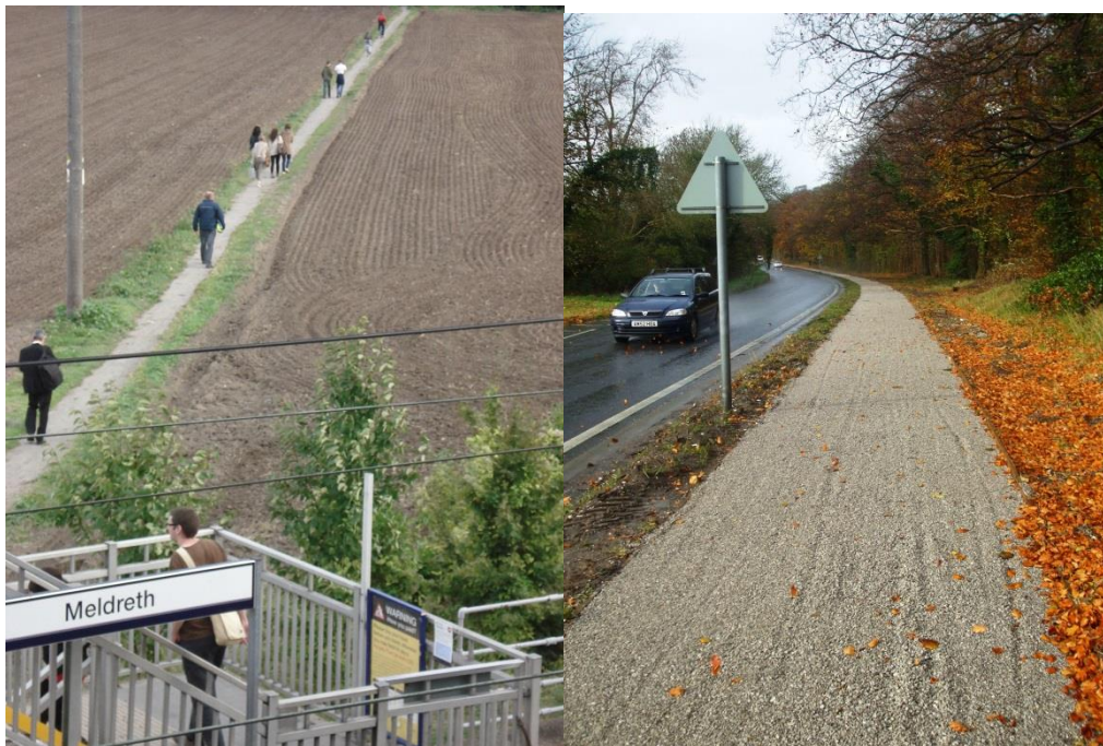
Rail commuters accessing Meldreth station on foot and the Wandlebury footpath/cycleway

This document provides an update to the ROWIP in line with the requirements of the Countryside and Rights of Way Act 2002. This update summarises the progress made since the ROWIP was adopted in 2006 and sets out future challenges for rights of way and countryside access to 2031 in the form of updated Statements of Action. This update to the ROWIP forms part of the third iteration of the Local Transport Plan, which is known as LTP3.