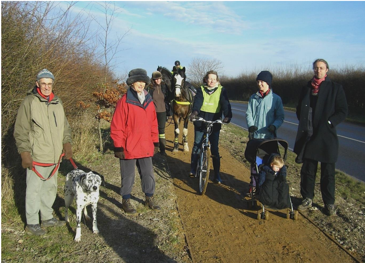
Newton verge track improvements being enjoyed by a range of users.

The consideration of rights of way as part of planning for new developments can help to address safety issues from the outset, and can sometimes help to provide safe crossings of major routes, or diversions to the rights of way network.