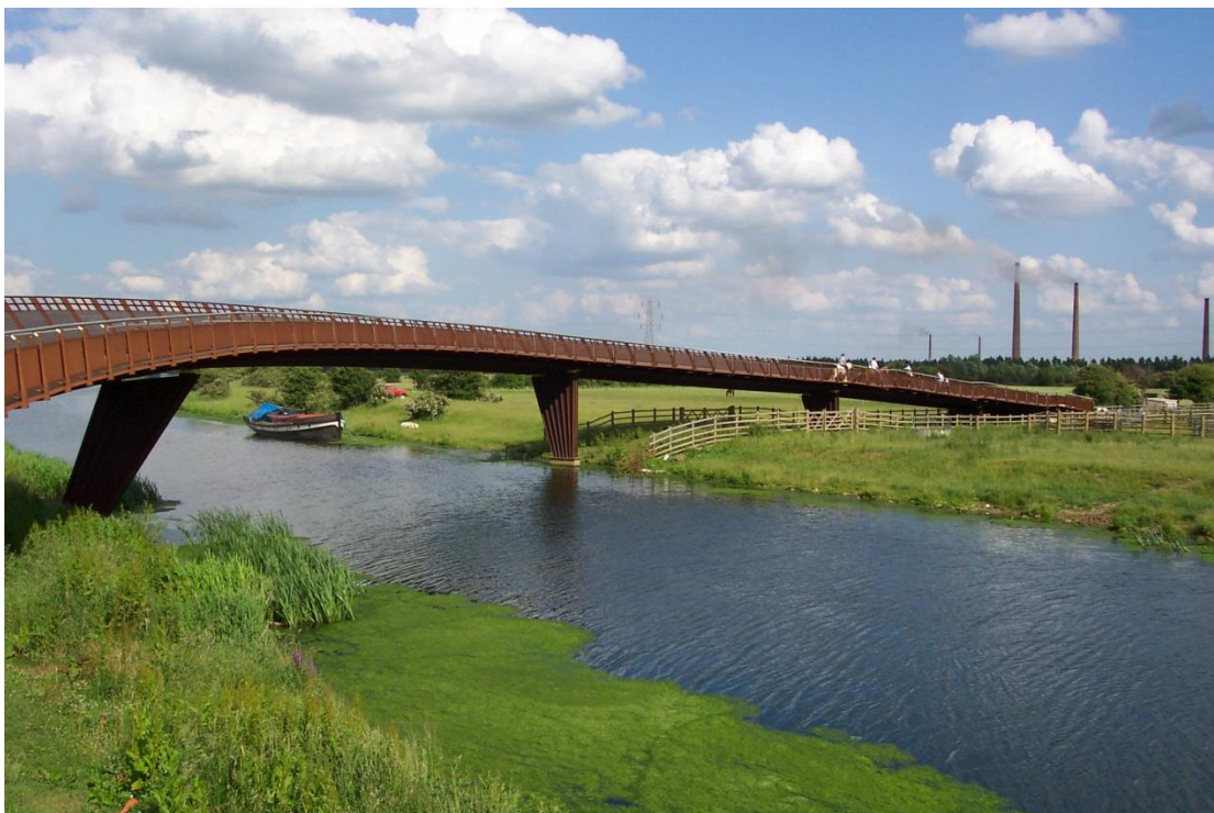
Bridge at Whittlesey

The updated Statements of Action set out in more detail how we will manage and improve the rights of way network, see Section 2.