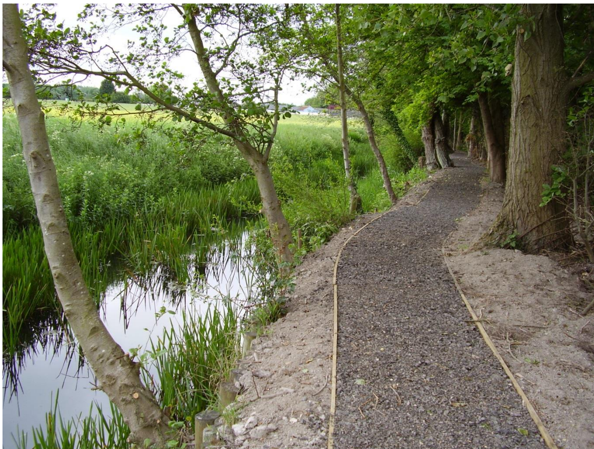
Shepreth footpath improvements