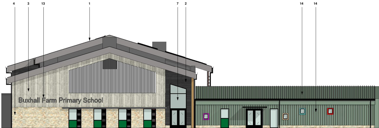
1 Elevation c-c (1-1) 1 : 100