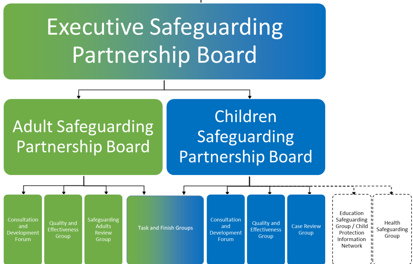
Figure 1: Diagram of Cambridgeshire and Peterborough safeguarding partnership structure

Bringing together adults and children's safeguarding on a countywide level ensures that safeguarding issues are looked at holistically in a "think family approach" and also provides a forum for transitional arrangement's to be discussed and agreed