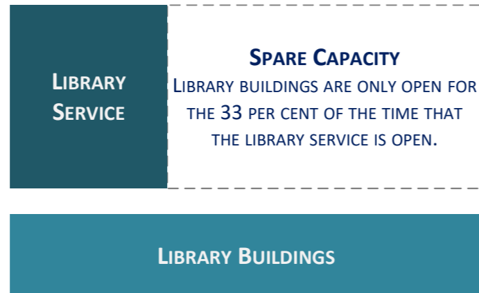
INDICATIVE FIGURES ONLY