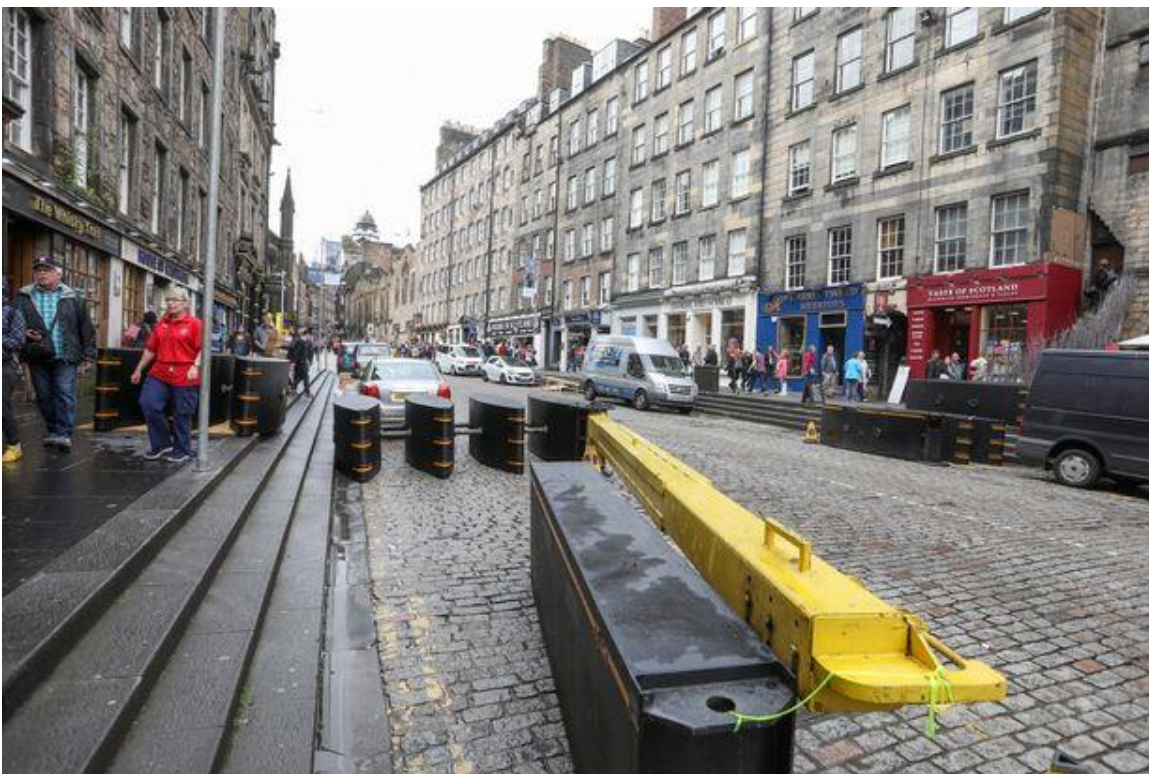
Edinburgh's Royal Mile (for Edinburgh Festival)