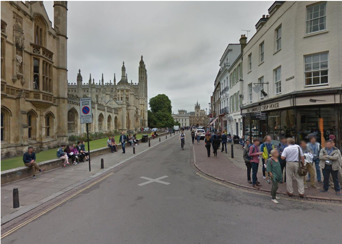
Kings Parade, Cambridge (Google Streetview image)