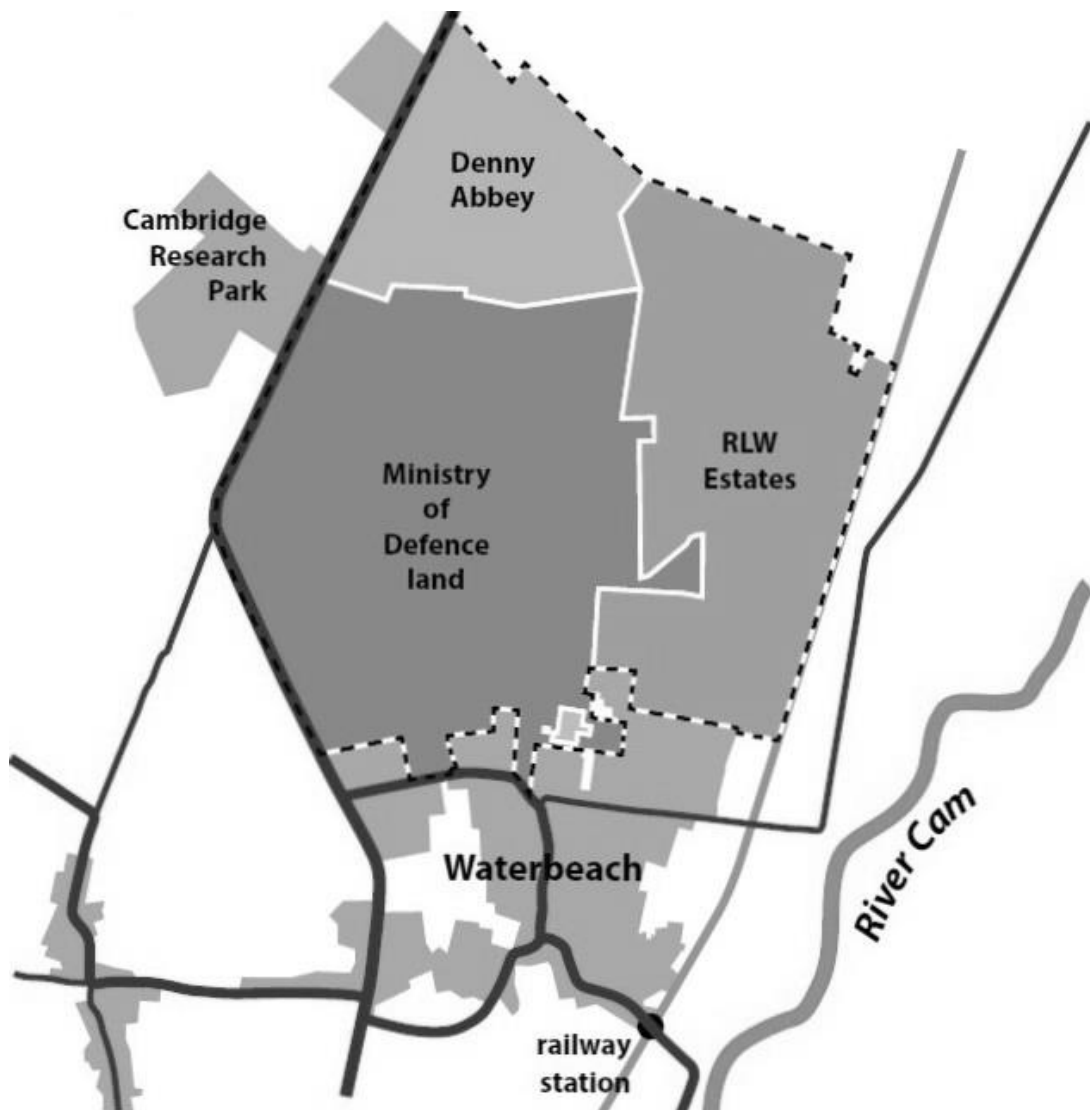
Figure 2: The Site