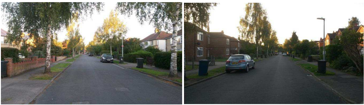
Weekday evening – looking both ways from #23

Weekday morning – looking both ways from #23