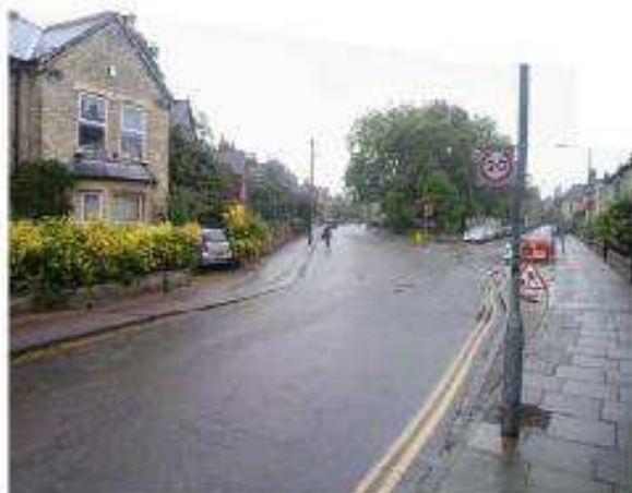
Illustrative sketch of proposals, looking South

Provide pedestrian zebra crossing Provide Zebra at well used crossing point. New parking spaces also possible just north of this crossing point.