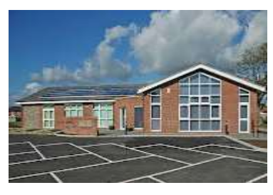
Community Centres and venues