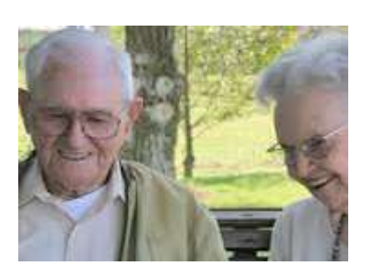
Health and social care providers

He has started earning credits at the hostel where he is staying. He spends them at the local gym with his children. He has ambitions to earn and spend across the local network.