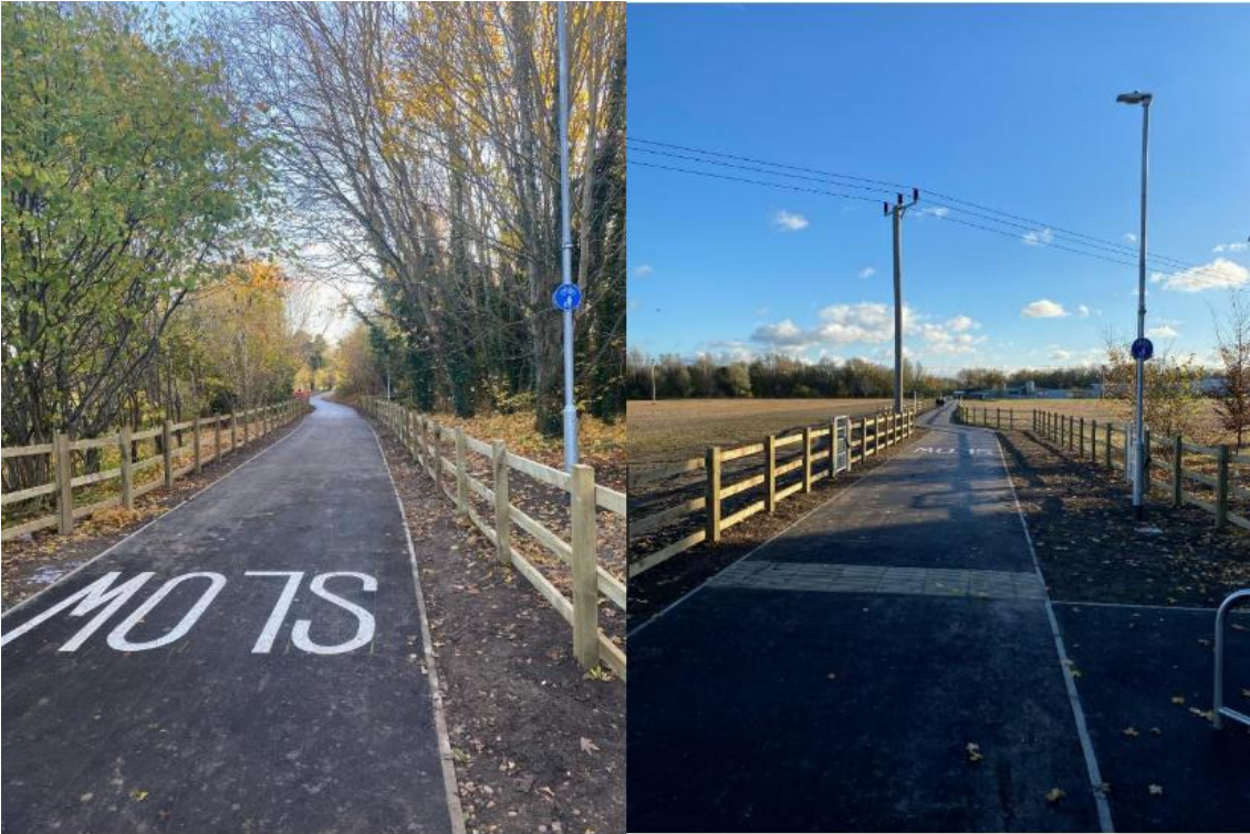
Linton Greenway- Newmarket Road