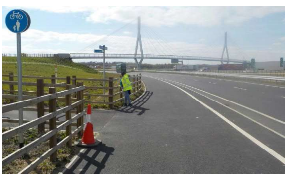
Figure 3 – view looking south east from A1307