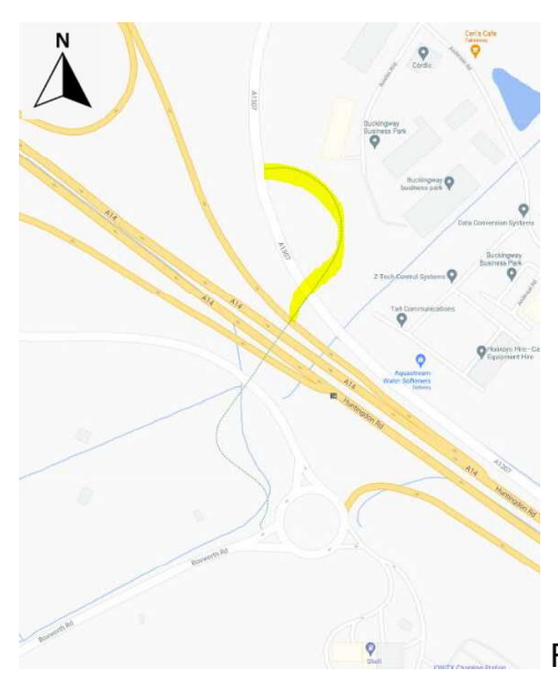
Figure 1 – Swavesey North Location Plan

The Non-Motorised User (NMU) route at Swavesey north ties in perpendicular to an adjoining NMU route along the A1307. The gradient is steep but consistent. There is generally good visibility with post and four rail fences installed along the boundary of the route.