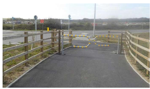
Figure 7- View looking towards uncontrolled crossing

On the Swavesey south route, the gradients are more gentle and the route leads to an uncontrolled crossing via a 90-degree bend. At the tie in to Boxworth Road, there are wayfinding signs for pedestrians, cyclists and horse riders, but the shared signs leading to the NMU bridge is only signed for pedestrians and cyclists. It is therefore unclear whether horse riders are expected to use the bridge.