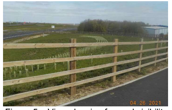
Figure 5 – View showing forward visibility

The slope on the northern approach ramp is steep and may encourage higher cyclist speeds. During the site visit, skid marks were observed on the downward approach to the barriers which may suggest potential