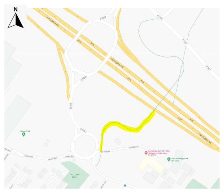
Figure 12 - Bar Hill South Location Plan

South of the NMU bridge, the alignment of the route follows a series of horizontal curves and gradients along this section appear to be steep (LTN 1/20 recommends a desirable maximum length of 30m for a 5% gradient). The edge of the NMU route is protected by a high fence infilled with mesh. Visibility along this section of the route is restricted by the horizontal curvature and fence. There is no visibility to other approaching cyclists/pedestrians or horse riders and there is an increased of conflict between cyclists and pedestrians/other cyclists and horse riders. Any conflicts between cyclists/pedestrians/horse riders is likely to occur within this section.