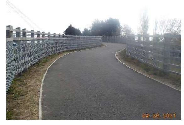
Figure 10: View of obstructed visibility