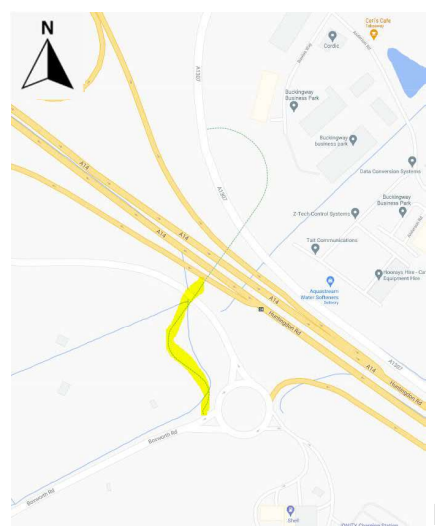
Figure 6- Swavesey South Location Plan

On the Swavesey south route, the gradients are more gentle and the route leads to an uncontrolled crossing via a 90-degree bend. At the tie in to Boxworth Road, there are wayfinding signs for pedestrians, cyclists and horse riders, but the shared signs leading to the NMU bridge is only signed for pedestrians and cyclists. It is therefore unclear whether horse riders are expected to use the bridge.