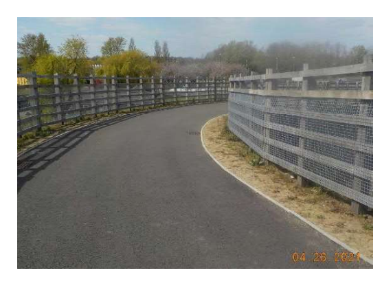
Figure 9: View of obstructed visibility

South of the NMU bridge, the alignment of the route follows a series of horizontal curves and gradients along this section appear to be steep (LTN 1/20 recommends a desirable maximum length of 30m for a 5% gradient). The edge of the NMU route is protected by a high fence infilled with mesh. Visibility along this section of the route is restricted by the horizontal curvature and fence. There is no visibility to other approaching cyclists/pedestrians or horse riders and there is an increased of conflict between cyclists and pedestrians/other cyclists and horse riders. Any conflicts between cyclists/pedestrians/horse riders is likely to occur within this section.