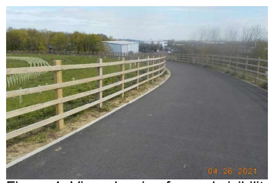
Figure 4- View showing forward visibility