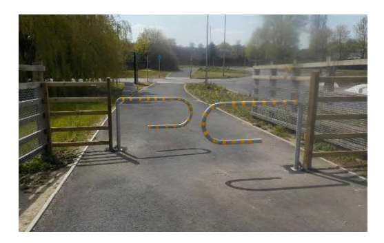
Figure 11 – View from route looking towards The Willows.

Visibility as the route approaches the Willows is generally good although it is partially obstructed by a large sign and overgrown vegetation in the northern verge of The Willows.