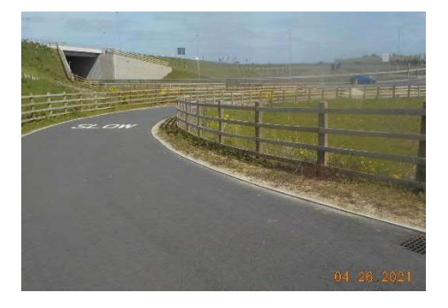
Figure 11 - View of forward visibility along route

The slope on the northern approach ramp is gentle and unlikely to encourage higher cyclist speeds. The visibility to other approaching cyclists/ pedestrians is generally good. There is a wide verge serving as a buffer zone between the NMU route and the carriageway. The risk of speed and collisions with other pedestrians/cyclists or vehicles at this location is low.