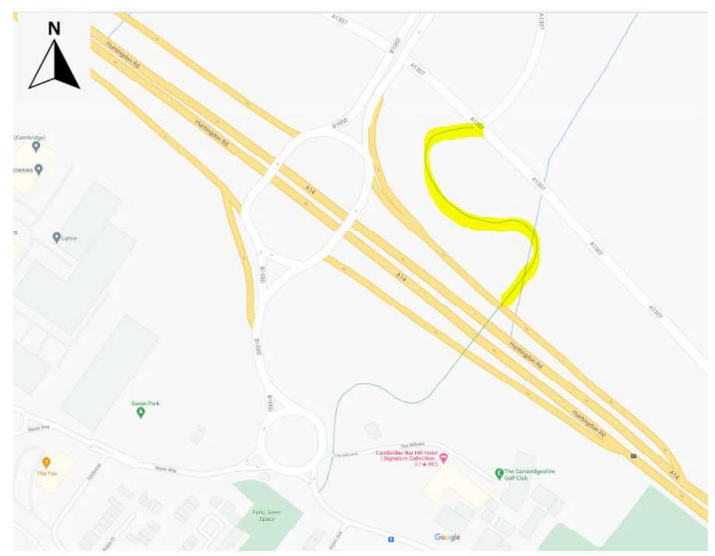
Figure 9 - Bar Hill North Location Plan

The NMU route over the A14 at its northern end joins the existing road (A1307) parallel to the A14 via a controlled crossing.