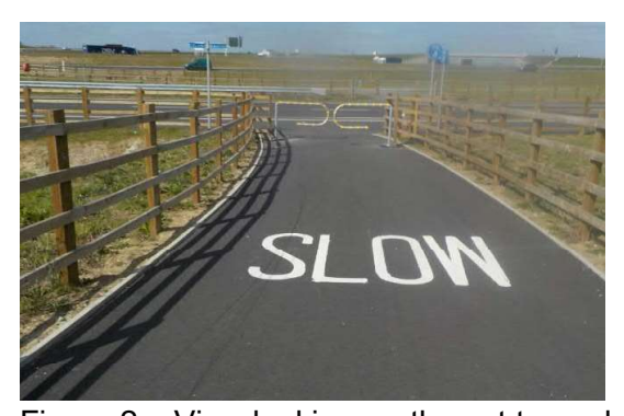
Figure 2 – View looking north east towards A1307

The Non-Motorised User (NMU) route at Swavesey north ties in perpendicular to an adjoining NMU route along the A1307. The gradient is steep but consistent. There is generally good visibility with post and four rail fences installed along the boundary of the route.