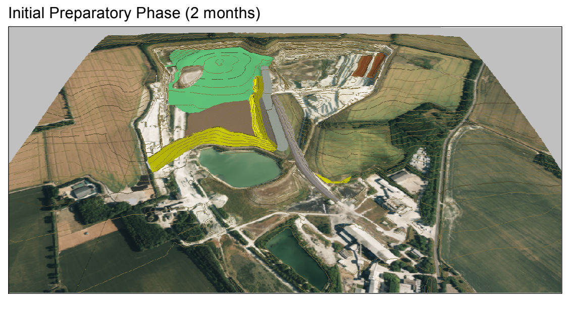
Active infilling during phase Active restoration during phase Restored