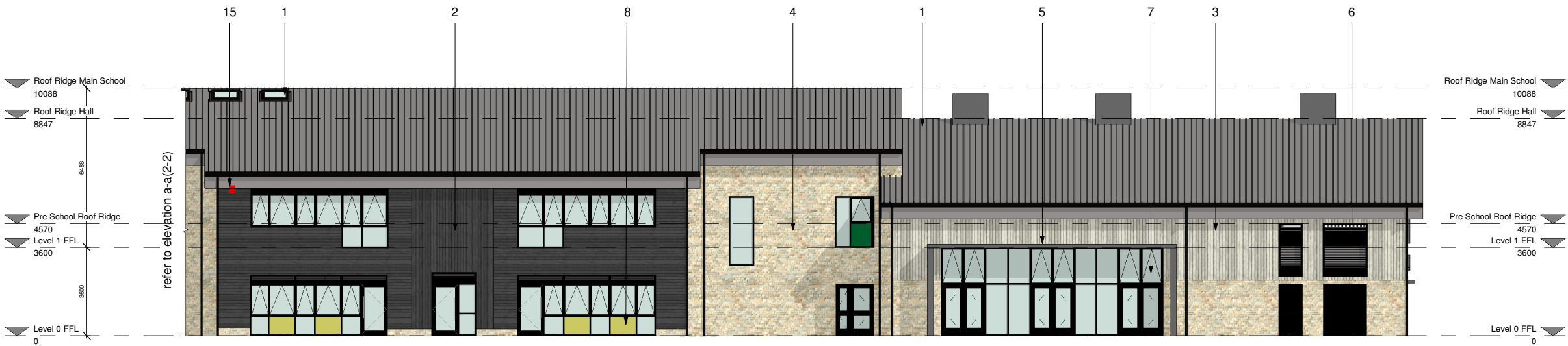
2 Elevation a-a (1-1) 1 : 100