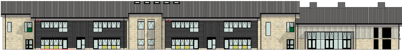
1 Elevation a-a 1 : 200