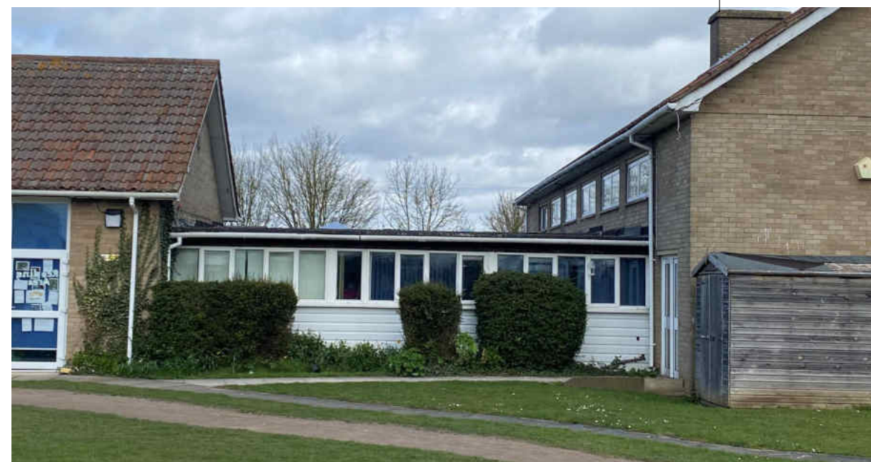
Existing Heads and Deputy's Office