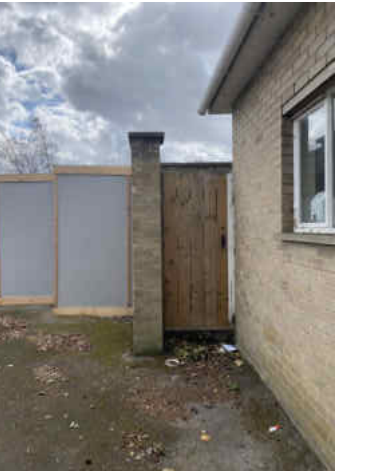
Walled Kitchen Access