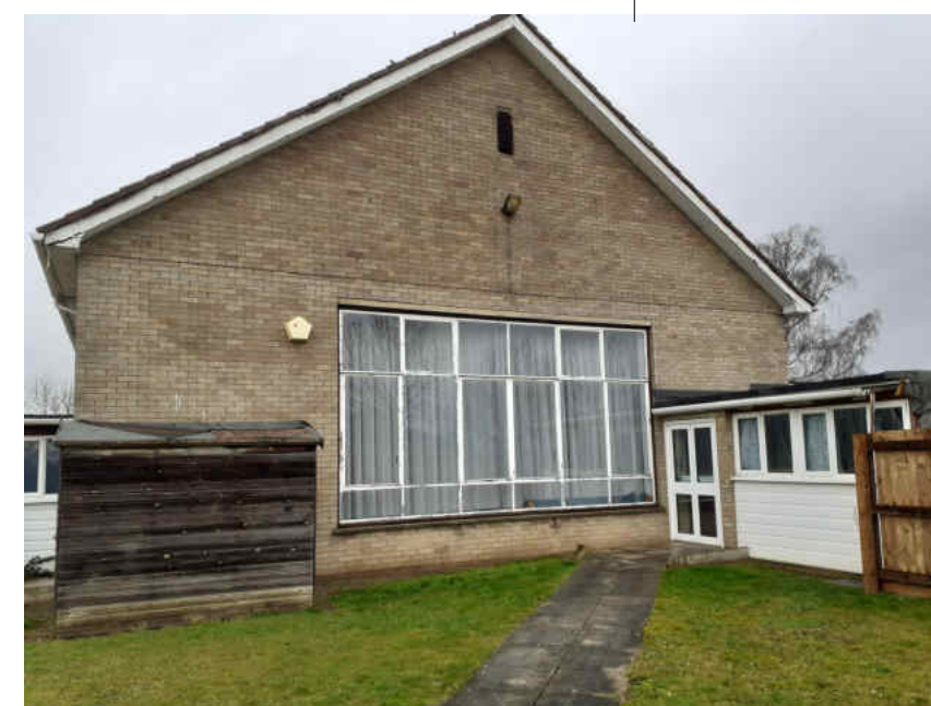
Main Hall South Elevation