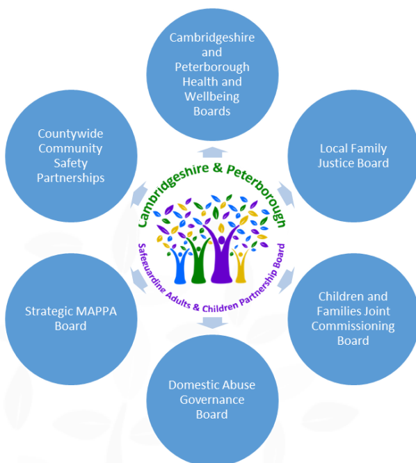
IMAGE 1 - LINKS TO OTHER STATUTORY BOARDS

The Executive Safeguarding Partnership Board has maintained its links with other groups and boards who impact on child and adult services this year. These are illustrated in Figure 1. This ensures that all aspects of safeguarding are taken into account by the other statutory boards and there is a co-ordinated and consistent approach. These links mean that safeguarding vulnerable people remains on the agenda across the statutory and strategic partnership and is a continuing consideration for all members.