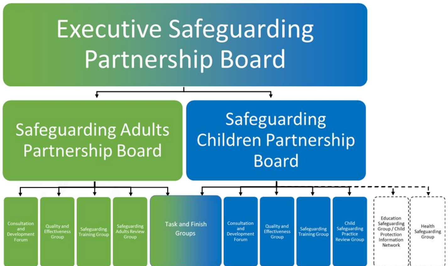
IMAGE 2 - DIAGRAM SHOWING THE STRUCTURE OF THE CAMBRIDGESHIRE AND PETERBOROUGH SAFEGUARDING PARTNERSHIP BOARD

The work of the various Boards and groups within the governance arrangements is overseen by the Independent Safeguarding Partnership Service. The service is managed by the Head of Service and includes roles that cover both adults and children’s agendas. Some of the roles are specialised in quality assurance and improvement, exploitation, training, communication and there are more general adult and children’s leads and dedicated administrative roles. The service ensures that there is robust, countywide independent scrutiny and oversight of multi-agency practice.