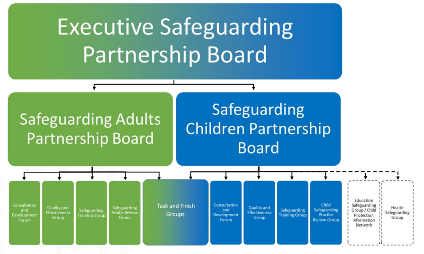
IMAGE 2 - DIAGRAM SHOWING THE STRUCTURE OF THE CAMBRIDGESHIRE AND PETERBOROUGH SAFEGUARDING PARTNERSHIP BOARD

The work of the various Boards and groups within the governance arrangements is overseen by the Independent Safeguarding Partnership Service. The service is managed by the Head of Service and includes roles that cover both adults and children's agendas. Some of the roles are specialised assurance in quality and improvement, exploitation, training, communication and there are more general adult and children's leads and dedicated administrative roles. The service ensures that there is robust. countywide independent scrutiny and oversight of multi-agency practice.