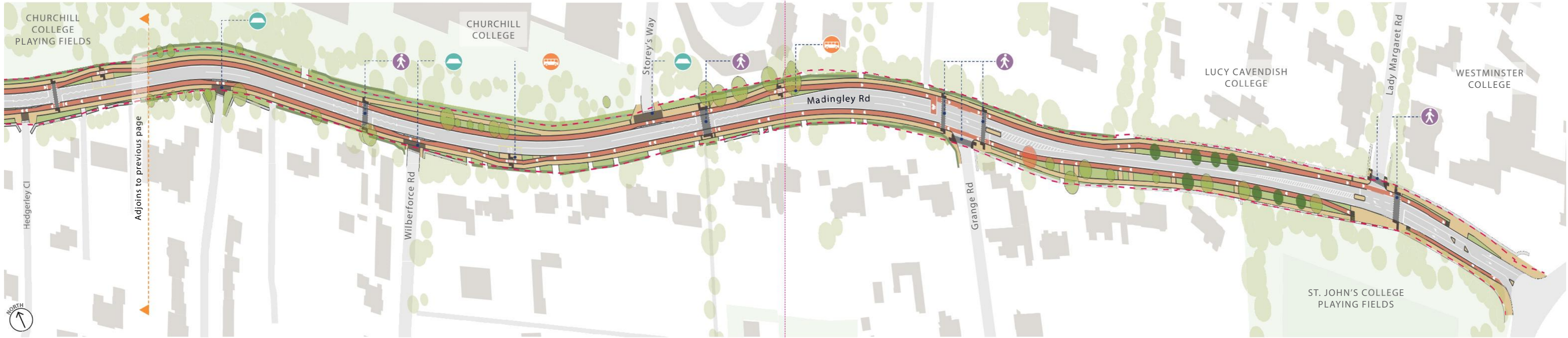
Plan not to scale