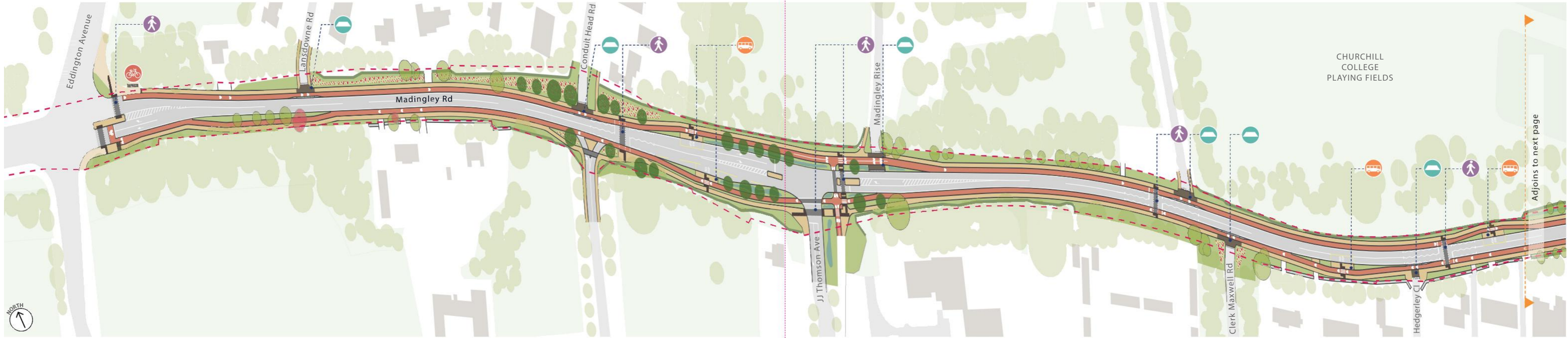
Plan not to scale