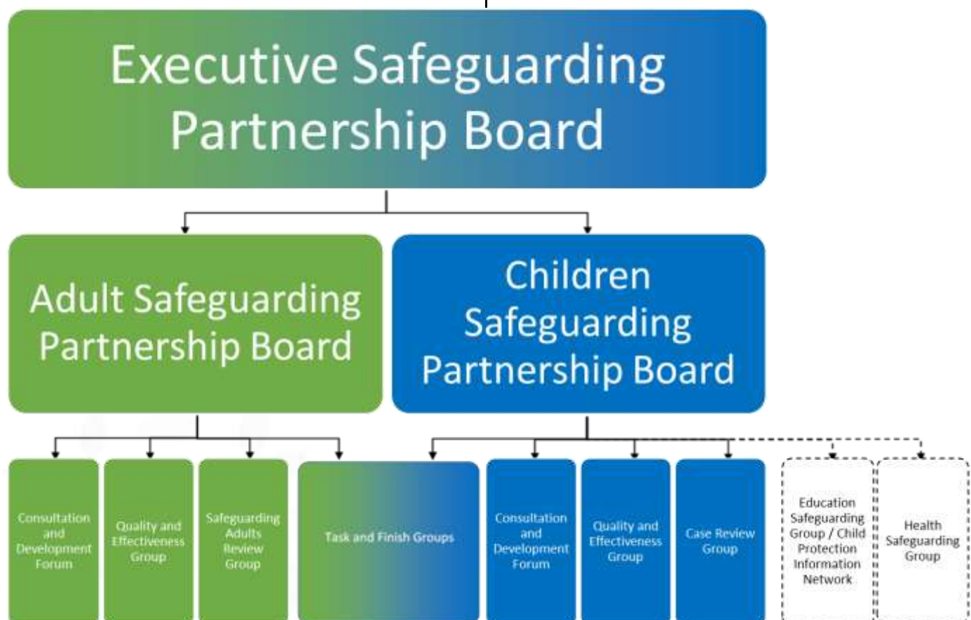
Figure 1: Diagram of Cambridgeshire and Peterborough safeguarding partnership structure

Bringing together adults and children's safeguarding on a countywide level ensures that safeguarding issues are looked at holistically in a "think family approach" and also provides a forum for transitional arrangement's to be discussed and agreed