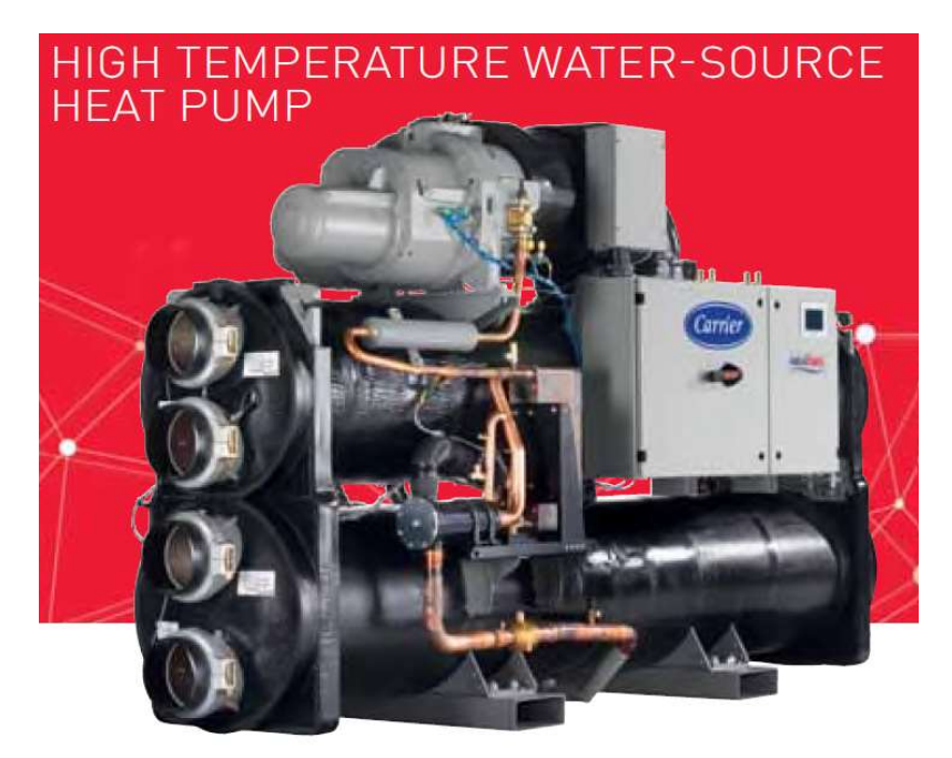
Fig 1. Comberton (one of two) 486 kW GSHPs